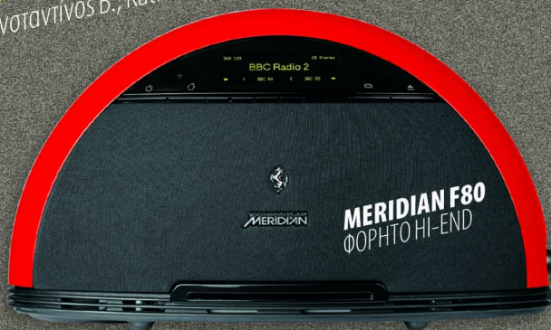
MERIDIAN F80 ΦΟΡΗΤΟ HI-END